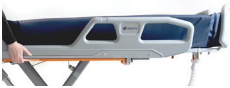
1. Upright for safety

Adjustable Side Rails offer three different positions