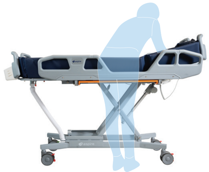
Middle Access Zones Improve carer ergonomics and patient cleaning access