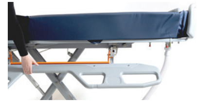
3. Lowered for gap-free transfers

Accessible Height Range 460mm low height enables standing transfers while the 900mm maximum height enables ergonomic carer provision