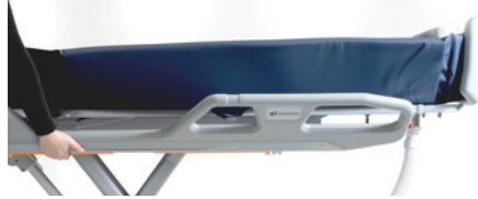
2. Midway for carer washing access