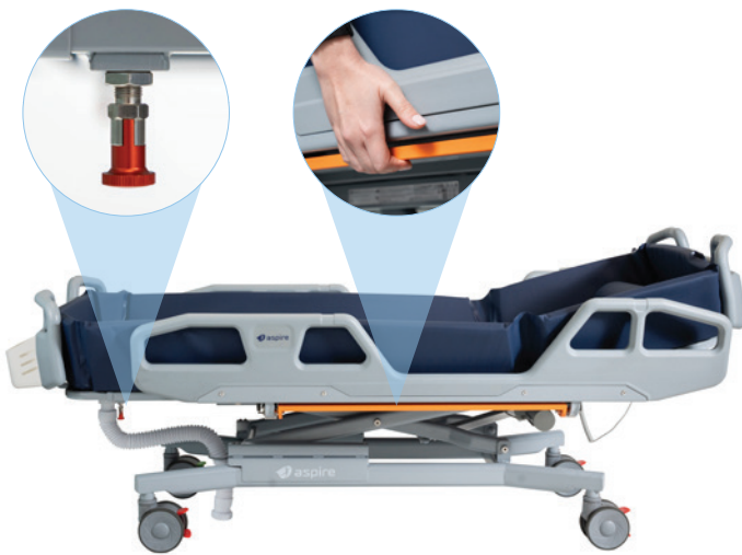
High Visibility Adjustments Bright adjustment points are simple and intuitive to operate

Soft Shower Liner designed to enhance patient comfort during showering or care, contributing to a better patient experience