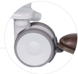
Large Castors x2 Locking