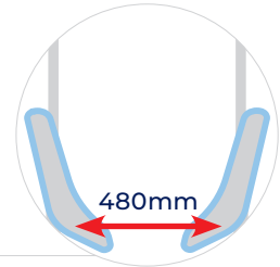
Wide Seat Entry Space