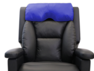
Profiled Headrest PH Sml/Med - CHP198310 Tall Med/Lrg - CHP198311