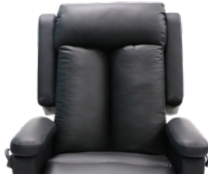
Kyphosis backrest PO2 (Standard)