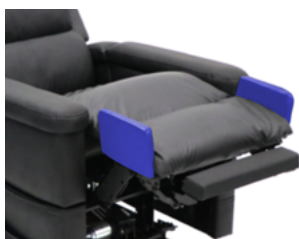
Channel legrest CL CHP198320