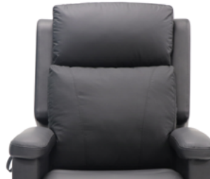
Classic style backrest PO3 Sml/Med - CHP198290 Tall Med/Lrg - CHP 198291