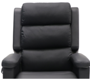
Waterfall backrest PO1 (Standard)