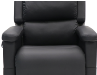
Pressure reducing foam (Standard) PR1