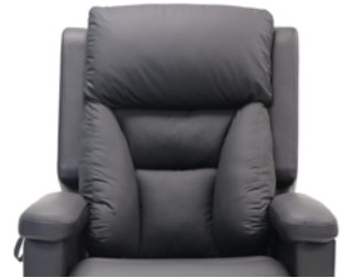
Advance Immersion backrest PO4 Sml/Med - CHP198295 Tall Med/Lrg - CHP198296