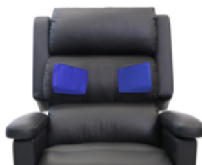
Lateral support blocks LS CHP198315