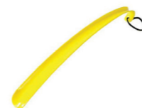
Aspire Shoe Horn DLD269160