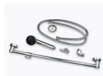
Hand Held Shower on Rail BTS107500