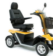
Pride Pathrider 140XL Scooter Various colours available SWL 181kg