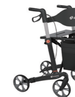
Aspire Vogue Carbon Fibre Seat Walker WAF705350 - Medium WAF705360 - Tall SWL 150kg