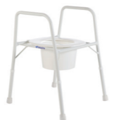
Aspire Over Toilet Aid BTT145005 - Aluminium BTT145000 - Treated Steel SWL 175kg