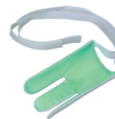
Terry Cloth Sock Aid DLD269090