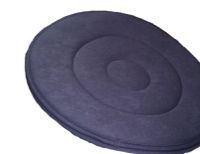
Aspire Swivel Cushion TSE673056