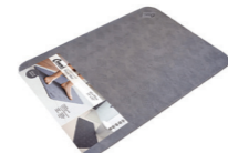
Conni Floor Mat Absorbent & Waterproof Various sizes and colours available