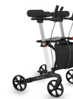
Aspire Vogue Forearm Walker WAF705400 SWL 150kg