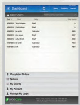
Intuitive dashboards: Full visibility of order status.