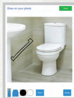
Home Modification Tool: Either take a photo of your client's room, use an existing image or use one of our line drawing templates. Then simply draw directly over the image.

The eTAC portal has been developed to generate better outcomes for your clients and help you optimise your consulting time.