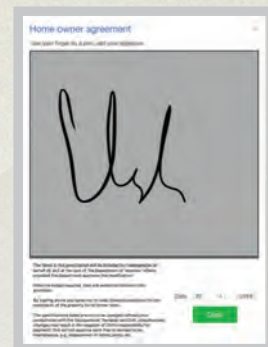
Minimal Paperwork: Clinical justifications, home-mod notes and client signatures all captured electronically.