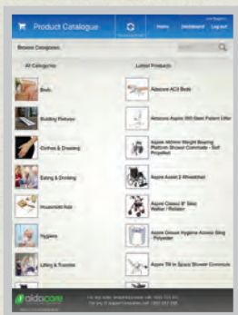
Thousands of Products at your fingertips: Complex product orders made easy by attribute identification.