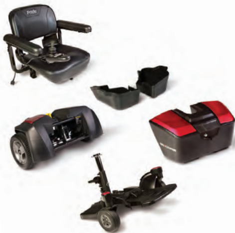
One-hand "Feather Touch" disassembly

The all-new Go-Chair is re-engineered from the ground up, offering a bold new style available in a choice of contemporary colors. Enhanced performance and comfort, along with feather-touch disassembly, allows you to enjoy light-weight travel and independence on the go. With an increased weight capacity of 136 kg (300 lbs.) and a sleek, bold look, the new Go-Chair makes travel easy.