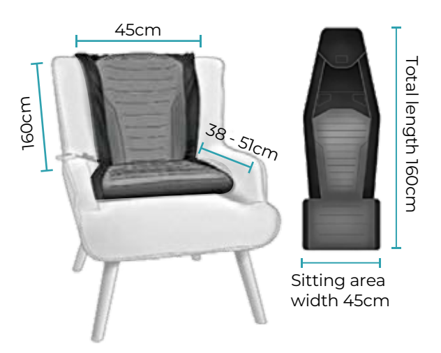
Chair back width 45cm Chair seat width 38 - 51cm Chair back height 160cm